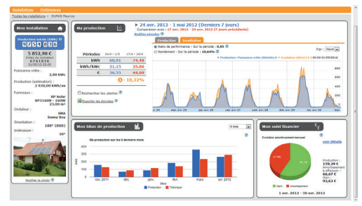
iOS and Android application