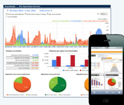
Demo website www.mylight-systems.com